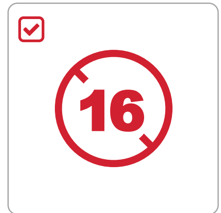
Over the age of 16