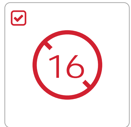
Over the age of 16