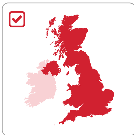
A Resident of the United Kingdom